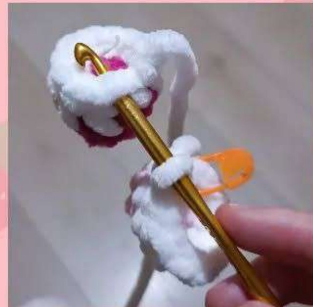
How to connect the legs.

Cut and leave a tail for sewing. Sew between R6-7 of the body.